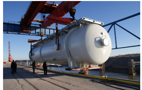
ABOVE: A sour water feed drum bound for the BP Amoco refinery in Whiting, Indiana - part of a $6 billion expansion project for the refinery, located on the banks of Lake Michigan.