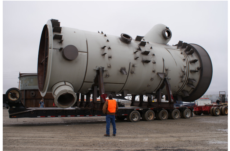
ABOVE: Industrial equipment arrives at HSI, Inc. for additional work before being loaded onto a barge for its final destination.